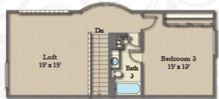
UPPER LOFT FLOOR 617 SQ.FT. FINISHED