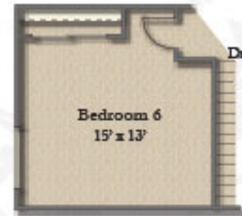
OPT. BEDROOM 6