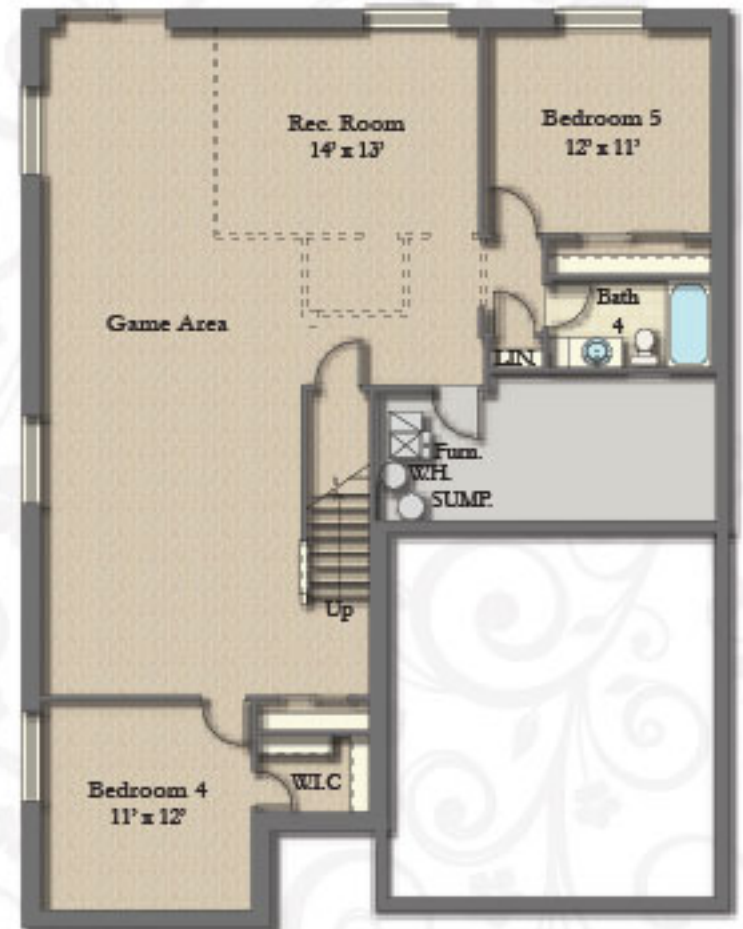
OPTIONAL FINISHED BASEMENT 1,610 SQ.FT. FINISHED